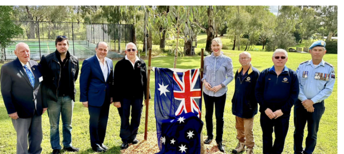
King Charles III Coronation Tree in Gumeracha at Federation Park.